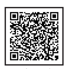
Scan for Measuring Guide & Order Form

Wide range of adjustability, Meets or exceeds up to 10" per gate, only the testing standards for 1-Million+ cycle tested (3) SKUs for 20" to 60" OSHA, ANSI and Canada springs, guaranteed for the COHS standards life of the gate Slam-Proof ™ Technology creating a controlled and soft close Unique gate design with Adjustable spring patents pending torque, allowing Compact box design adjustability on how saving customers $8-18+ fast the gate closes per gate on shipping